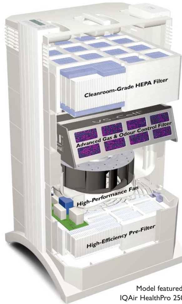
Model featured: IQAir HealthPro 250

Each IQAir HealthPro is individually tested and certified. Each unit comes with its own 2-page Certificate of Performance.